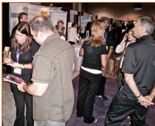
EXHIBIT DATES :

10x10 booth space, 6-foot draped table, carpeting (show color), chair, wastebasket, and I.D. sign (electricity is extra).